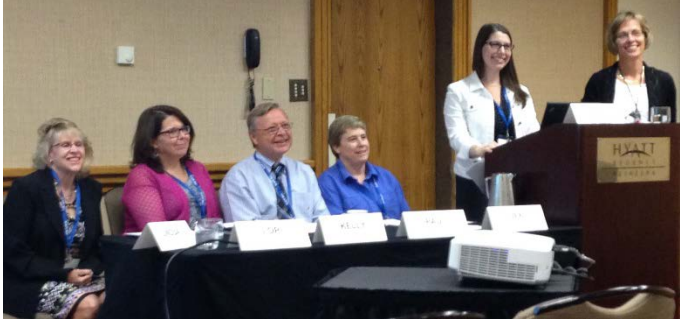
Practice Facilitator Panel presentation

In a panel presentation, practice facilitators who have been assisting practices in the <u>F</u>acilitator-<u>l</u>ed Participant <u>Ow</u>ned (FLOW) arm of the asthma tool kit dissemination project (ADAPT-NC) discussed their successes, challenges and lessons learned in their role as practice facilitator during the implementation of the evidencebased tool kit.