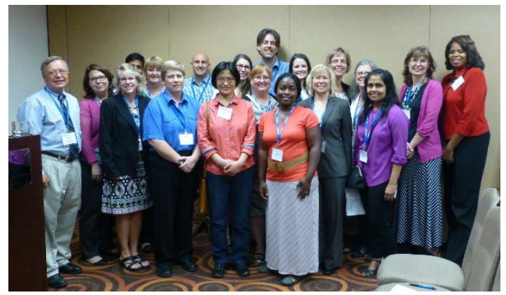
North Carolina PBRN Staff, Researchers and Stakeholders

The theme of this year's conference was Engagement and NCNC and other PBRNs used this as an opportunity to highlight our stakeholder engagement in various research projects. We congratulate the Carolina's Medical Center PBRN MAPPR for being one of the groups that were able to bring some of their stakeholders to the meeting. Having patient and provider stakeholders at the meeting to give their perspectives was powerful and enriched the conference.